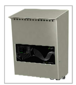
2kW wall box (MFGS0208.001)