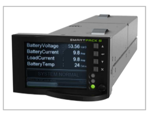
Smartpack S controller