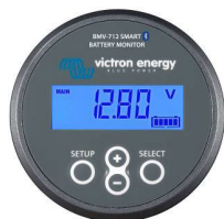
Bluetooth sensing BMV-712 Smart Battery Monitor