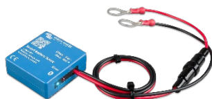
Bluetooth sensing Smart Battery Sense