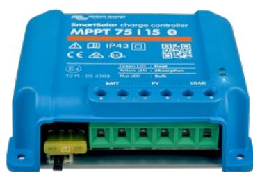
SmartSolar Charge Controller MPPT 75/15